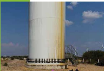
Typical absorbent boom failed to absorb lubricant oil