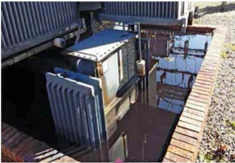
Classic containment system creates a "swimming pool" of contaminated water that needs to be pumped out